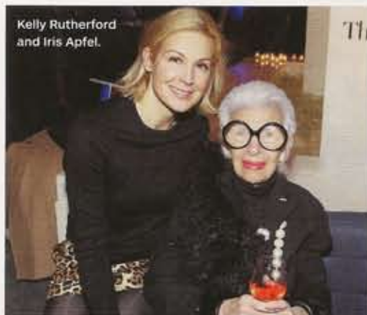
Kelly Rutherford and Iris Apfel.