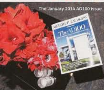
The January 2014 AD100 issue.