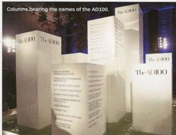
Columns bearing the names of the AD100.

EXCLUSIVE VIDEO To see more of the 2014 AD100 gala, including interviews with honorees, go to archdigest.com/go/video .