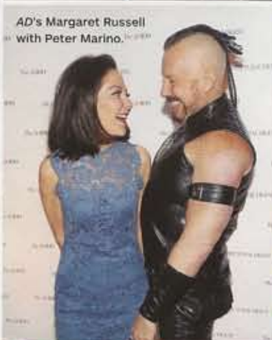
AD's Margaret Russell with Peter Marino.