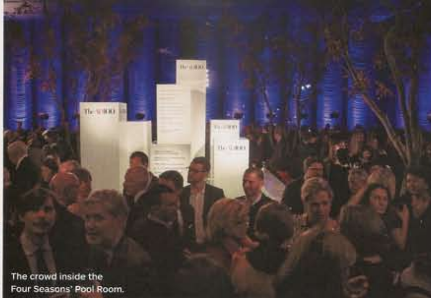
The crowd inside the Four Seasons' Pool Room.