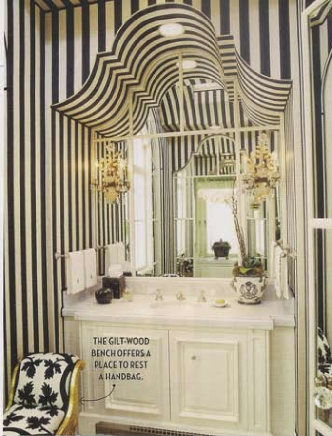
THE GILT-WOOD BENCH OFFERS A PLACE TO REST A HANDBAG.

"Powder rooms can be magical. Often they're diminutive, quirky spaces, which is all the more reason to turn them into fabulous jewel boxes. Consider their tucked-away locations and small scale—and, frequently, lack of natural light—an invitation to do something over-the-top, or at least a little unexpected. Charm your guests with whimsy, twinkling beauty, and sophisticated elements of surprise."